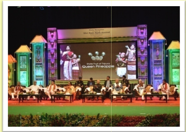
Short film on 'Queen Pineapple of Tripura' screened during Hon'ble President of India declared Queen Pineapple as State Fruit of Tripura