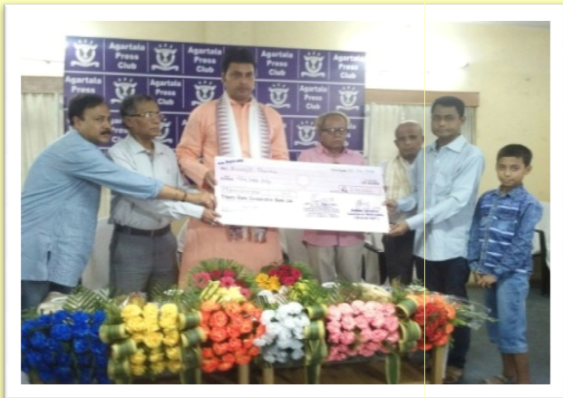
Financial Assistance under Tripura Working Journalists Welfare Scheme, 2000