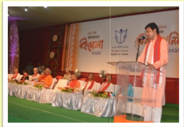
Inaugural programme of Agartala Book Fair, 2018