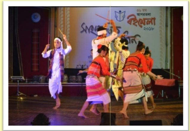
Folk Cultural dance programme at Agartala Book Fair 2018