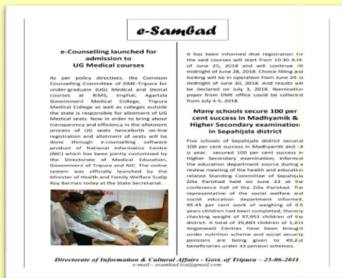
e-Sambad - daily web news bulletin