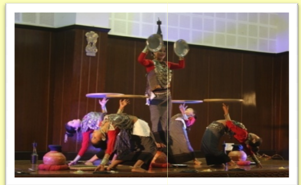
Hozagiri dance performance in reception ceremony of NITI Forum