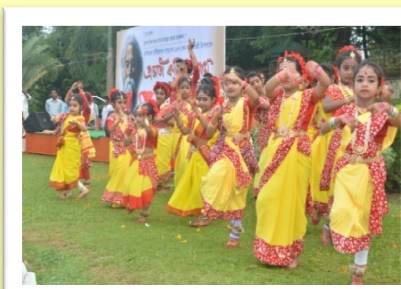
Prabhati Kabi Pranam, 2018 at Rabindra Kanan, Agartala