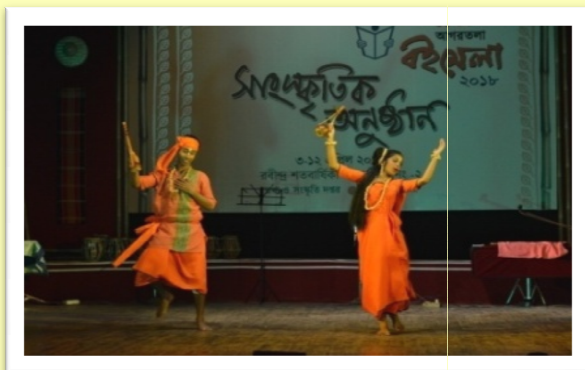
Boul Sangeet Programme at Agartala Book Fair 2018