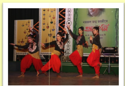
Nazrul Janma Jayanti 2018 at Rabindra Satabarshiki Bhawan