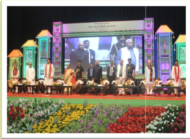
State Reception of the Hon'ble President of India at Rabindra Satabarshiki Bhawan