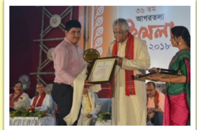
Kali Kinkar Debbarma Memorial Award at Agartala Book Fair 2018