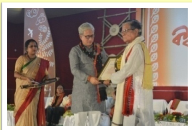
Pandit Deendayal Upadhyaya National Integration Award at Agartala Book Fair 2018