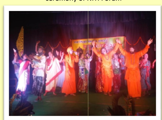
Jatra Utsav held at Belonia