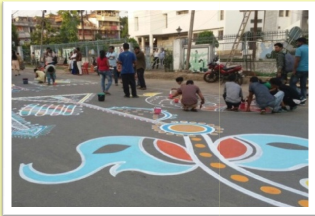
Street Painting at Agartala Book Fair 2018